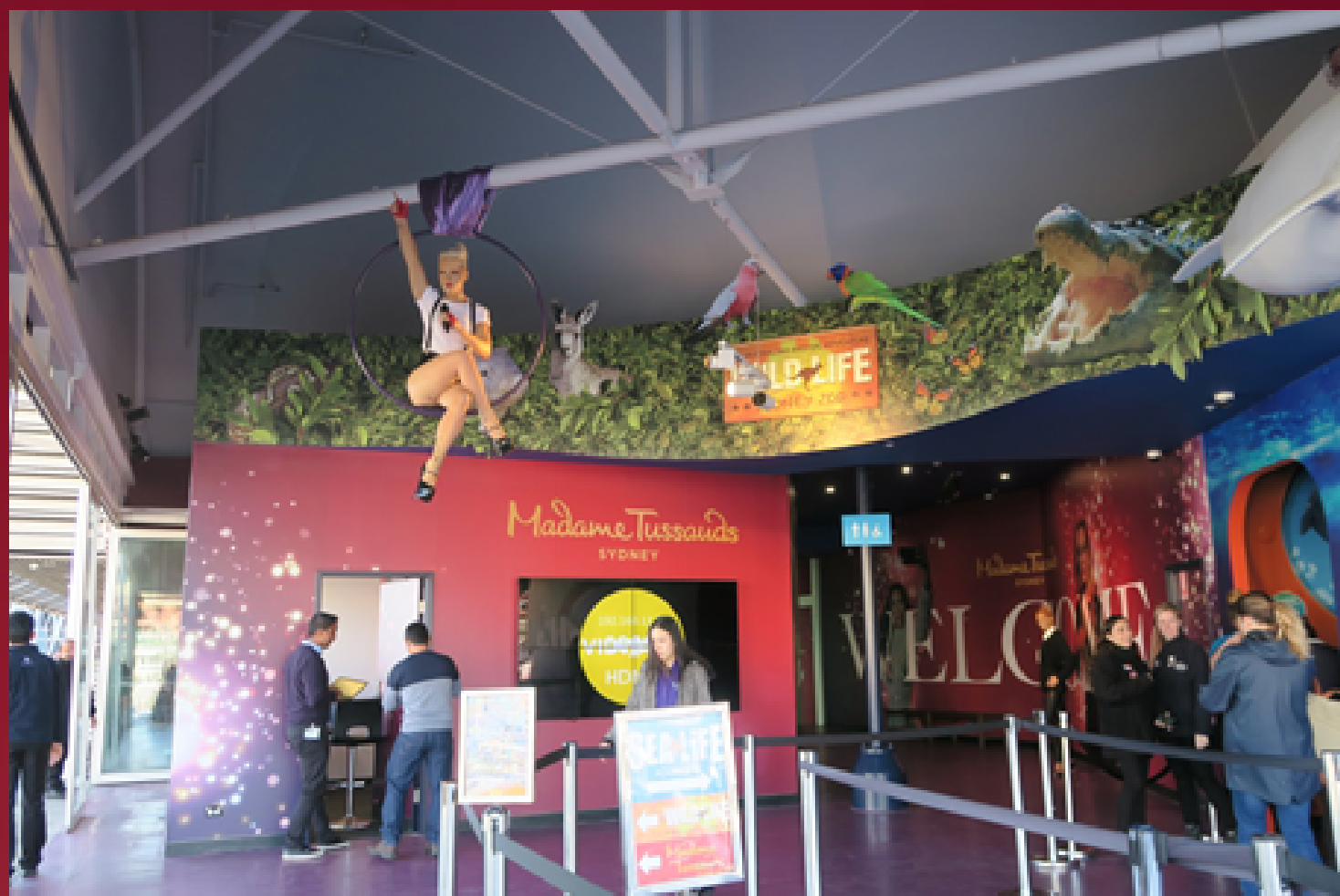
Madame Tussauds entry